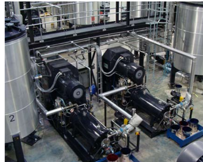
The LME Horizontal Bead Mills, with patented Dynamic Classifier System (DCCS), provide increased throughput rates with virtually no blockage.

instrumentation, process pipe work with lagging, the complex electrical installation, product filters, transfer pumps, dust extraction system, fume extraction system, compressed air system, chilled water and heating system and many hundreds of smaller items.