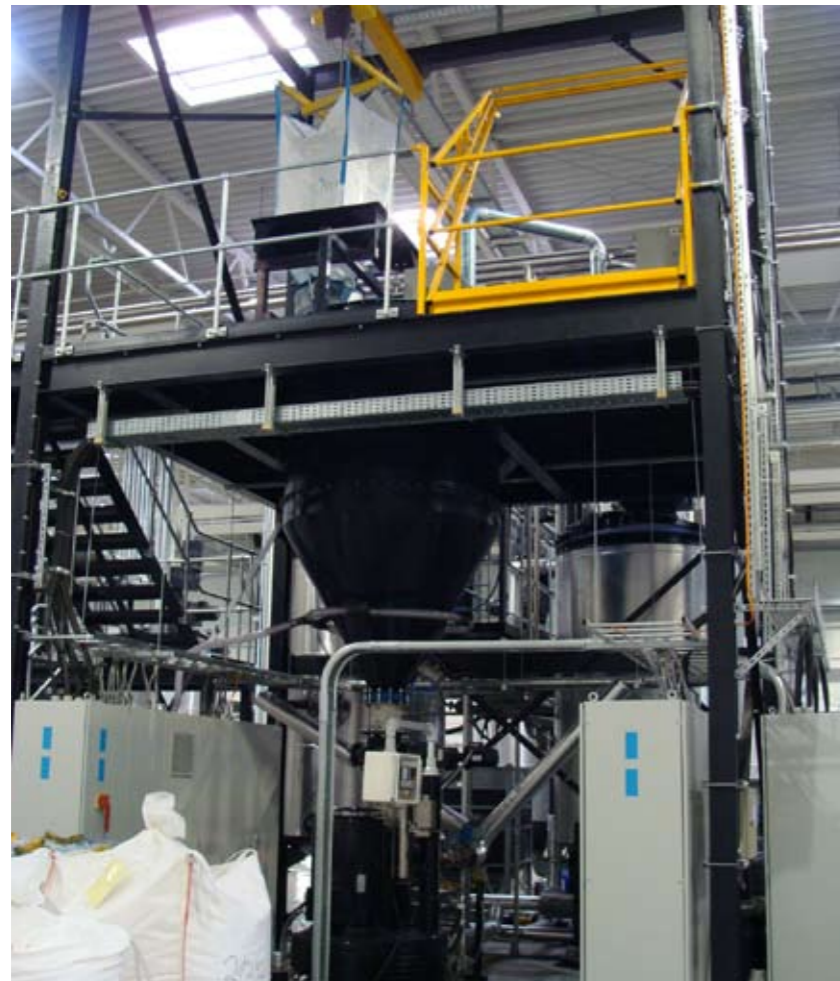
The revolutionary PSI Mixers used in the plant, with a combination of vacuum dispersing, shearing and pressure wetting resulted in high productivity, with excellent results and total reproducible quality.

After preliminary design studies and engineering works, NETZSCH proposed a solution using all new machinery, and the latest production technology. S & S commissioned NETZSCH in December 2006 to build and commission the new plant.